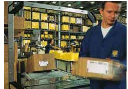
Manual Postal sorting